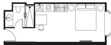
Standard / Superior Room