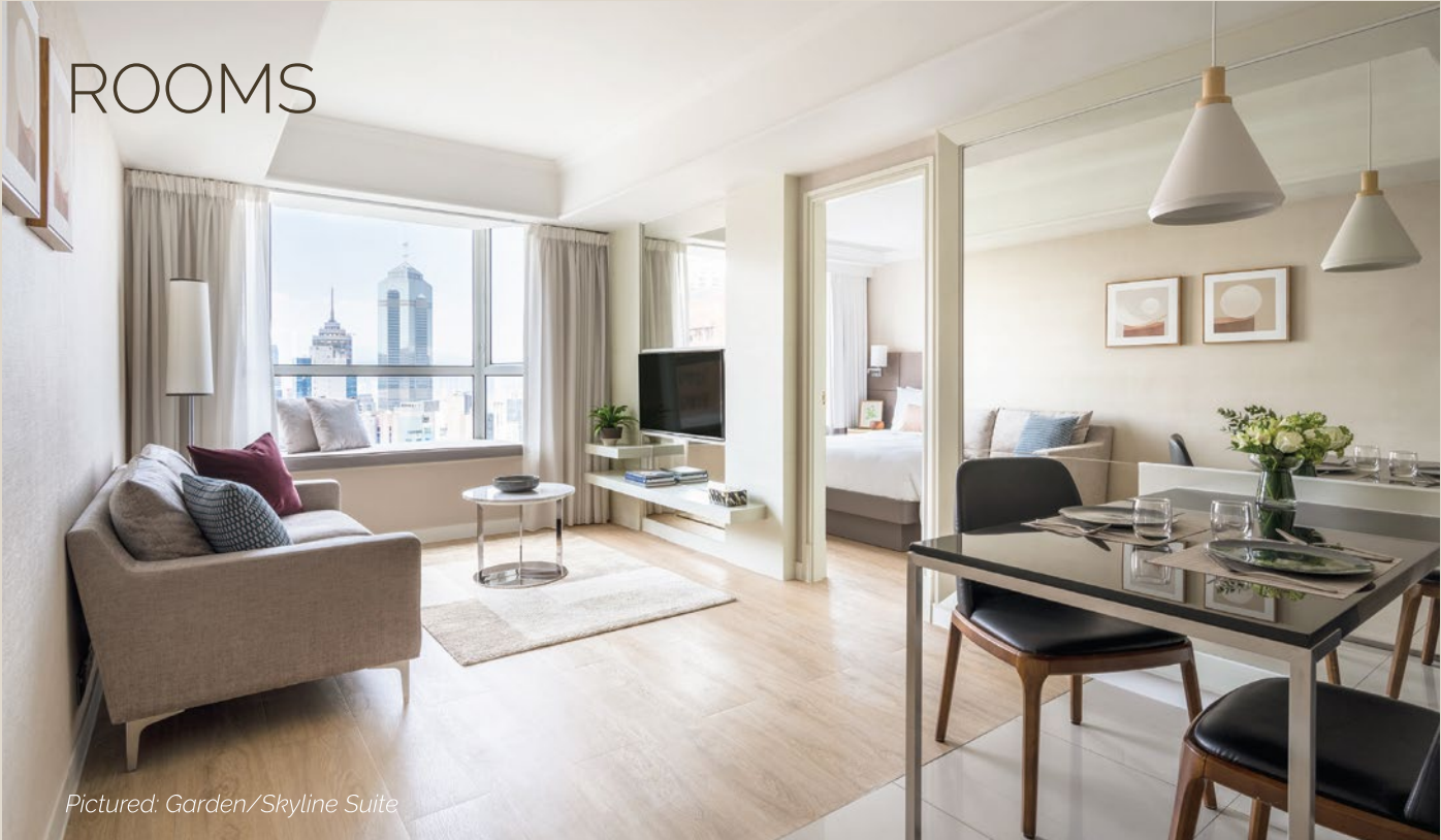
Standard/ Superior Suite